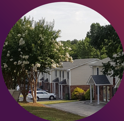
Lexington Park Apartments 62 unit multifamily in Lexington, NC